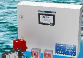
LOCAL APPLICATION SYSTEM