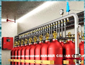
CO 2 FIRE EXTINGUISHER