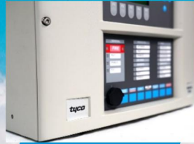
FIRE DETECTION SYSTEM