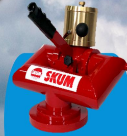
DEEP FAT FRYER SYSTEM